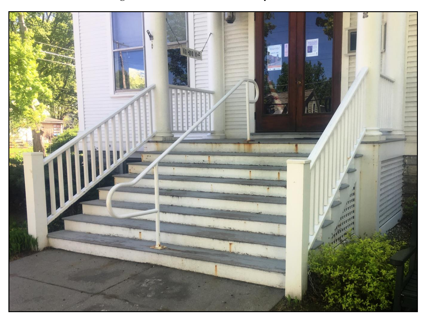
Figure 2. North Street view of Library stairs.

Town of Bristol Request for Proposals Lawrence Library Front Stairs Painting Page 4 of 5