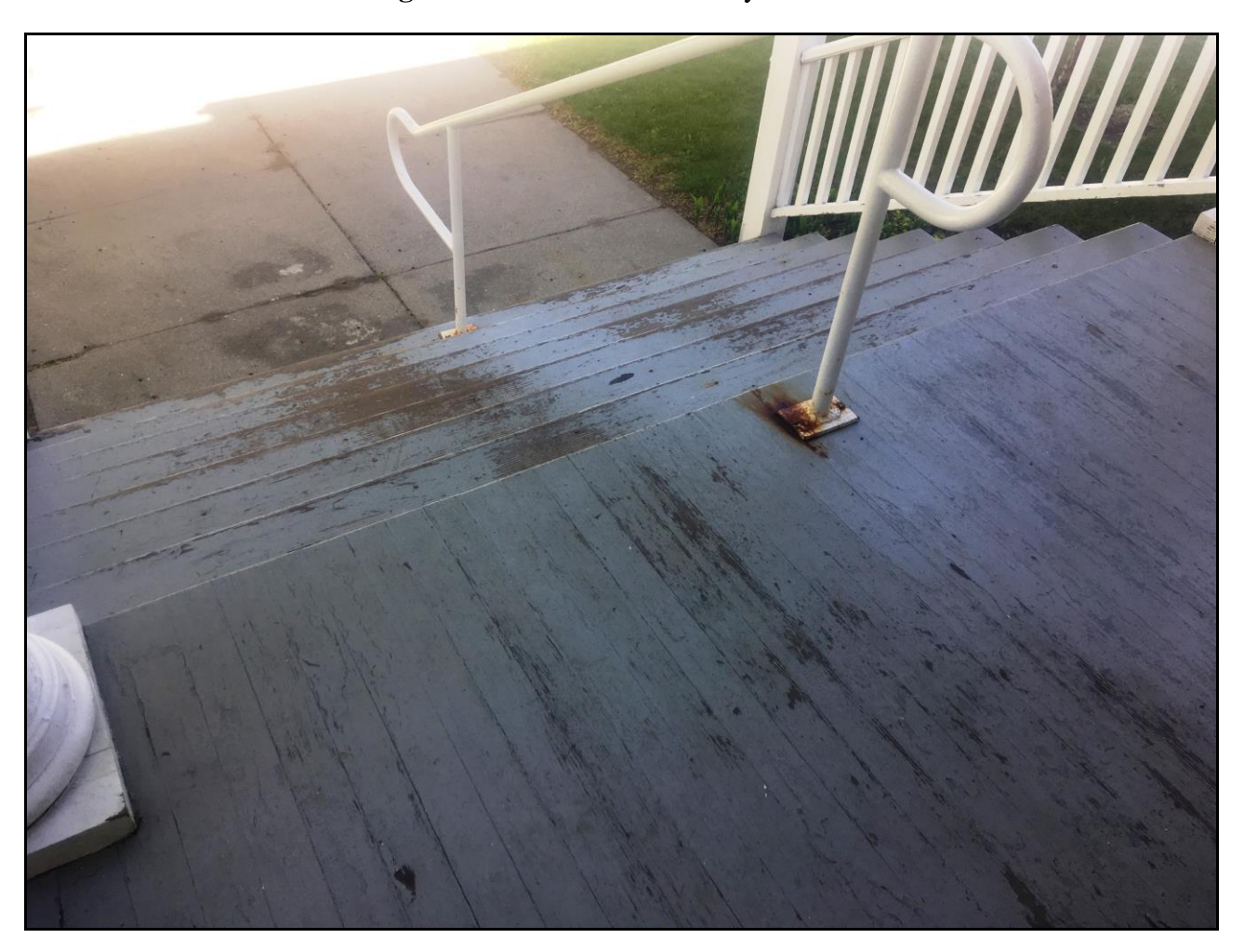
Figure 3. Deck view of Library stairs.

Town of Bristol Request for Proposals Lawrence Library Front Stairs Painting Page 5 of 5