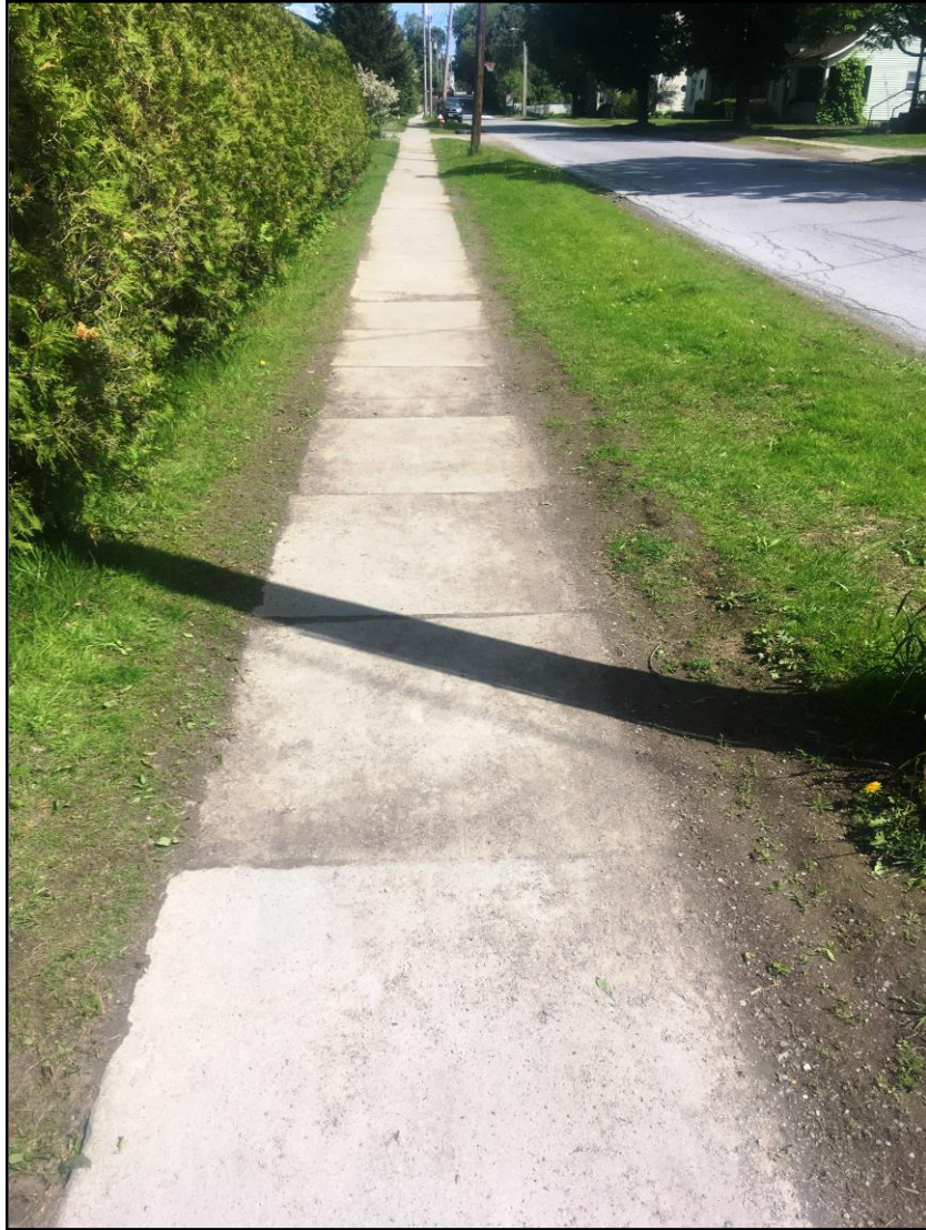
Figure 3. Mountain Street. Sidewalk will need to be elevated to eliminate ponding.