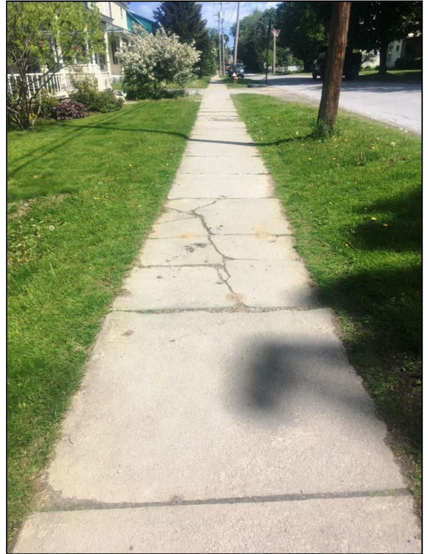
Figure 4. Mountain Street, facing north.