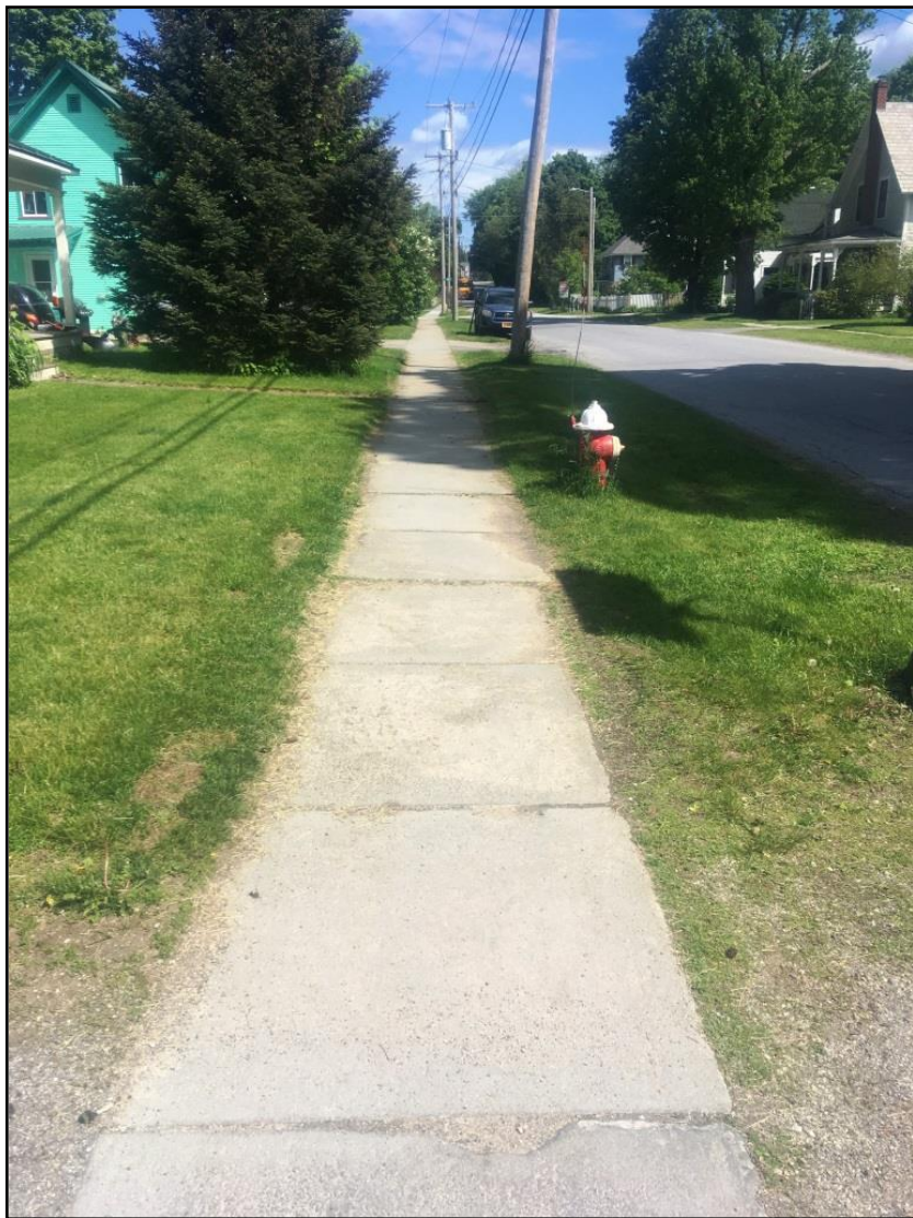
Figure 5. Mountain Street, facing north.