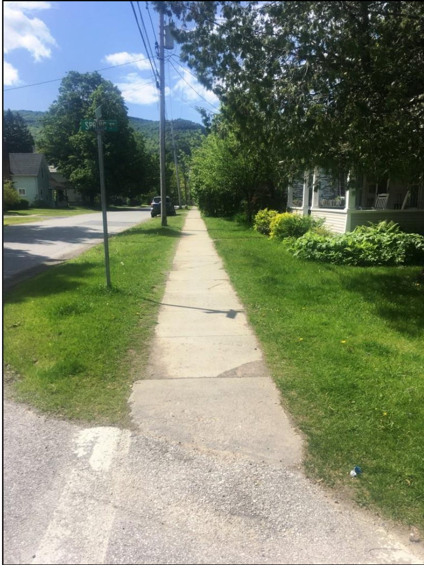
Figure 7. Mountain Street at Spring Street, facing south. Truncated dome needed.