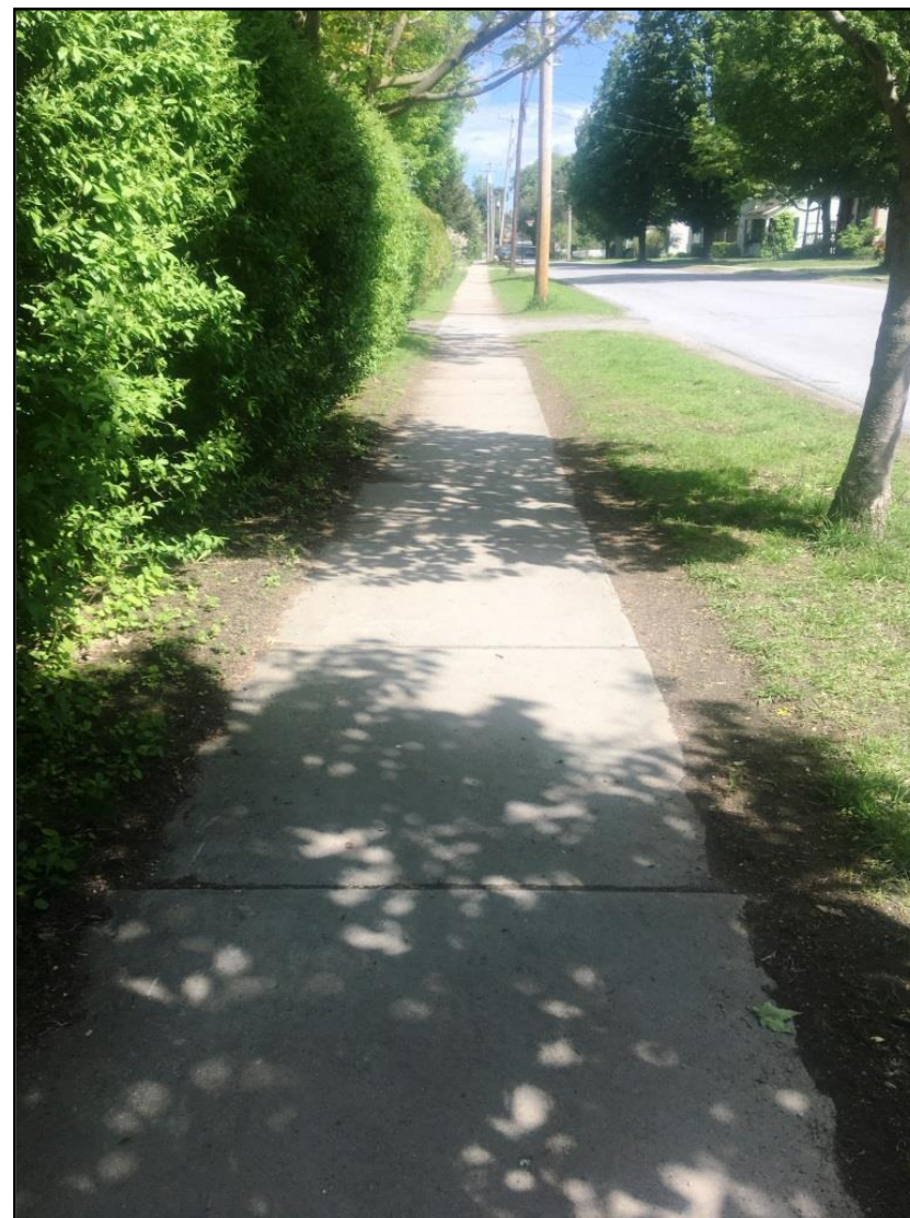
Figure 2. Mountain Street, facing north.