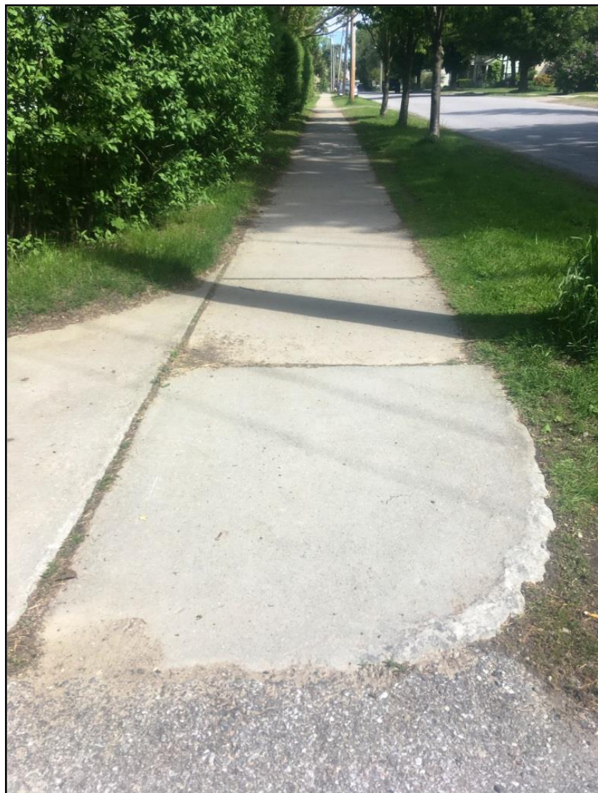
Figure 1. Mountain Street at Garfield Street. Truncated dome needed.