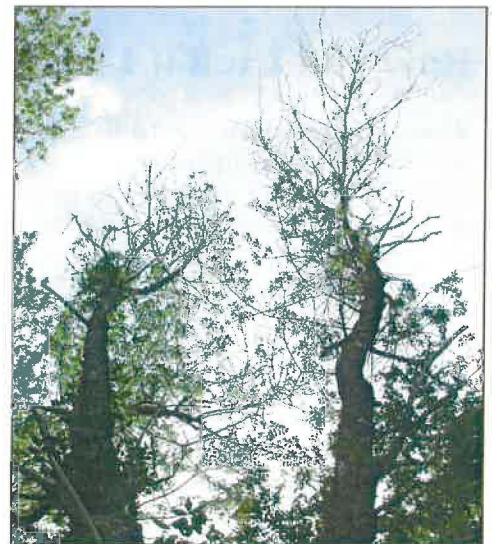
Infested trees die within 4 years.

Branches as small as 1" in diameter can be infested. Upper branches are often infested first.