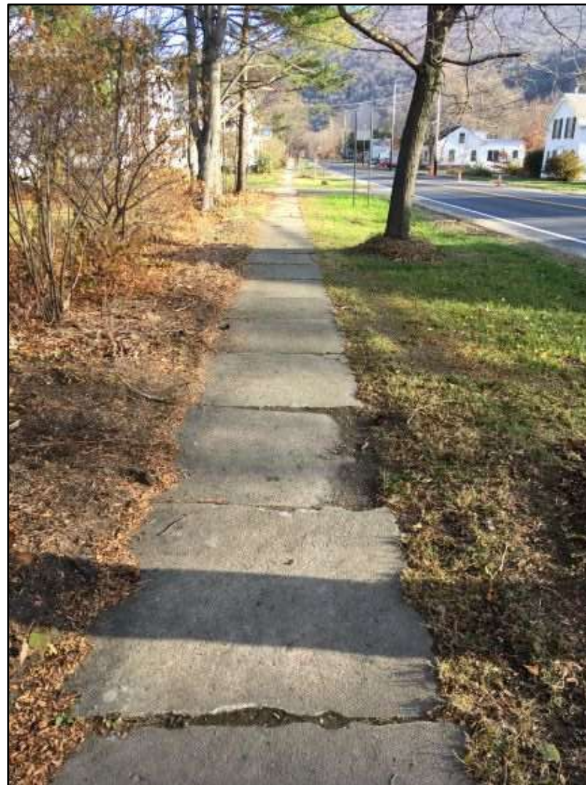
Figure 8. East Street looking eastward. (11/20/2020)