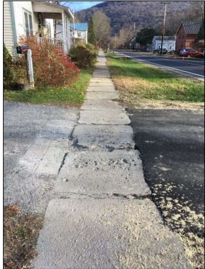
Figure 12. East Street looking eastward. (11/20/2020)