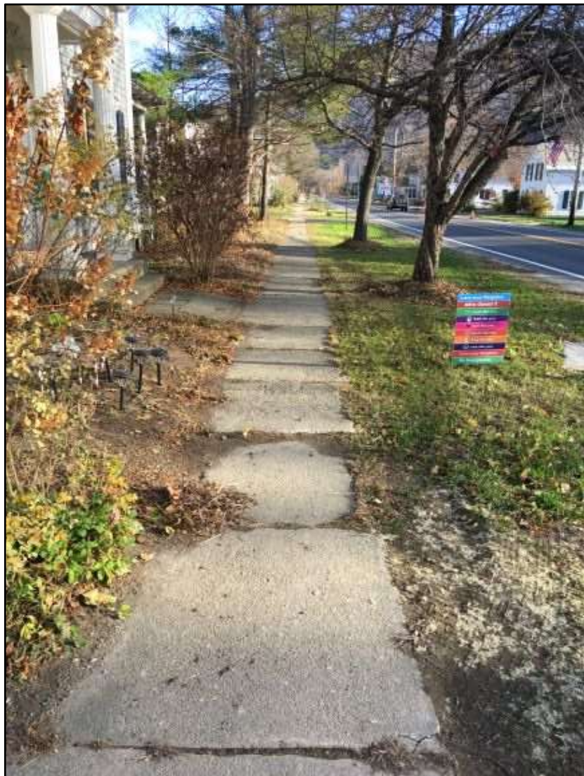
Figure 7. East Street looking eastward. (11/20/2020)