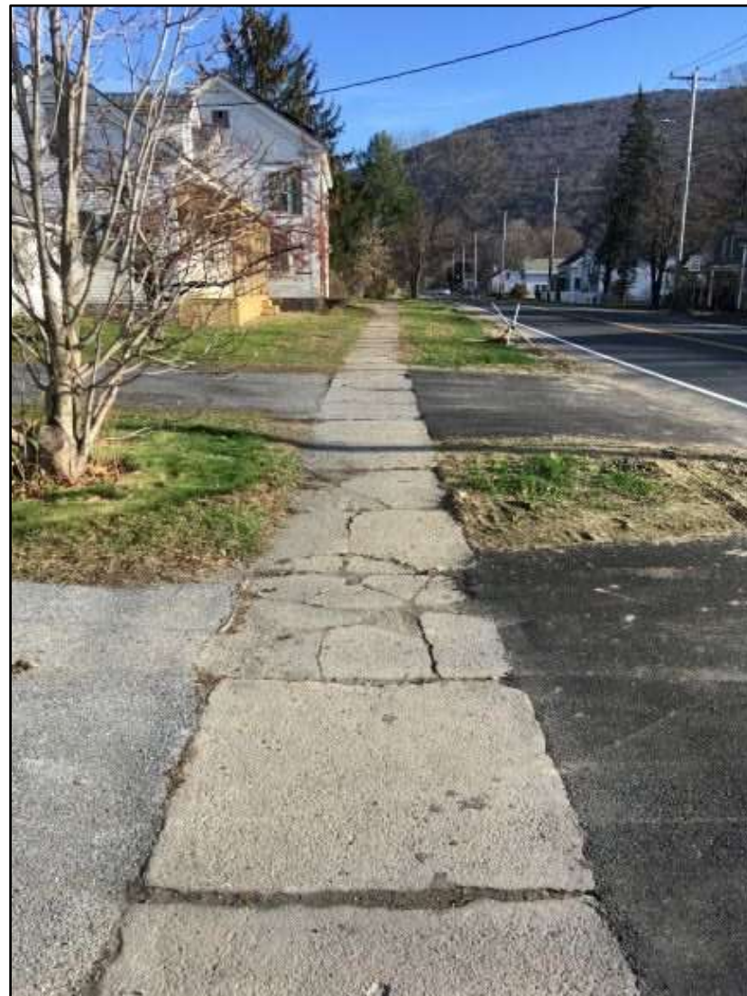
Figure 2. East Street looking eastward. (11/20/2020)