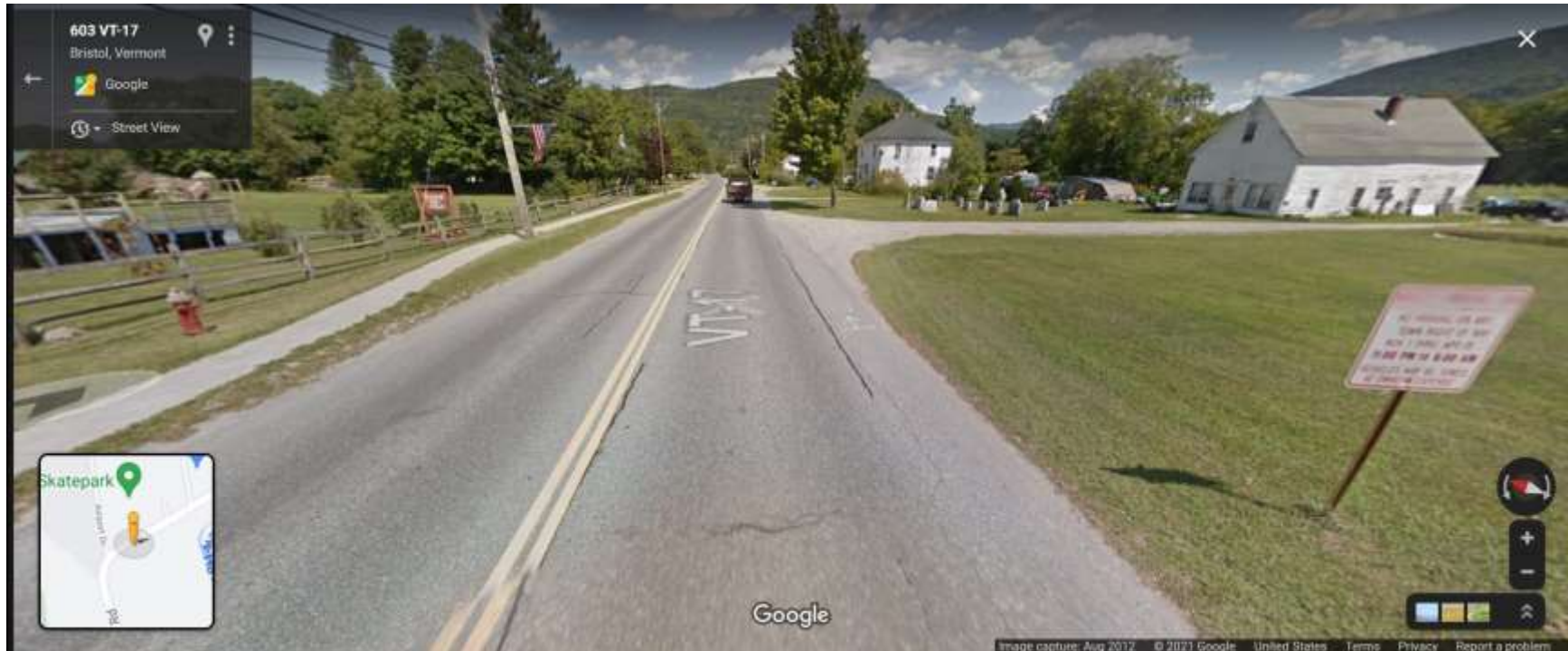
Figure 2. Google Map street view on West Street looking eastward. Firehouse Drive is at right.