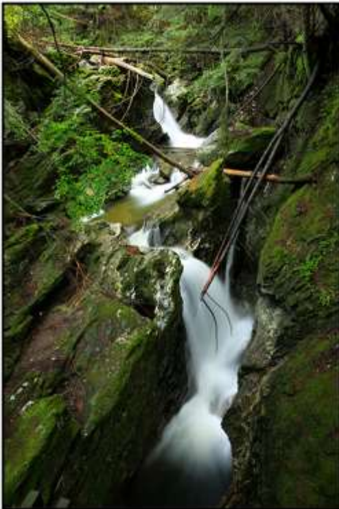
Figure 1. Burnham Falls provides a scenic focal point at Memorial Park in Bristol.

Memorial Park in Bristol has been known alternatively as Memorial Forest Park, and Veteran’s Memorial Park. A scenic waterfall, known locally as Burnham Falls, is the focal point of Memorial Park (Figure 1). This parcel is located in the northeastern corner of the town on the south side of VT Route 17 approximately 1.6 miles east of the junction with VT Route 116. The E911 address for the park is 1600 Drakes Woods Road. The property consists of 19.3 acres that straddle the Baldwin Creek, and its forested streamside areas are accessed by footpaths that lead from a gravel parking area off the south side of VT Route 17 near the Starksboro town line (Figure 2). Park lands were acquired by the town in the 1950s and are currently managed through the joint efforts of the Bristol Selectboard, the Bristol Conservation Commission, and the Bristol Recreation Department.