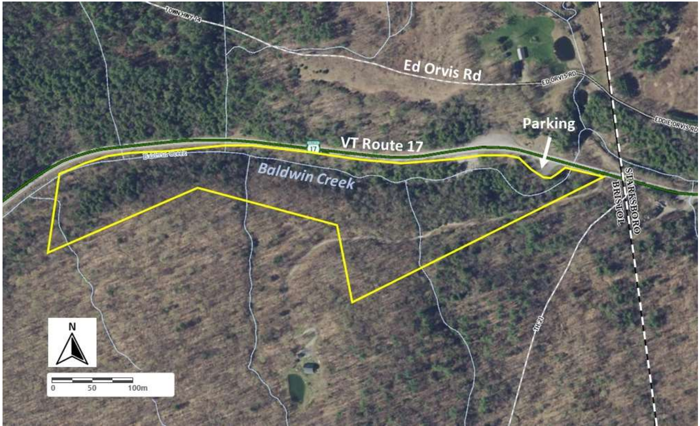
Figure 2. Approximate boundaries of Memorial Park, accessed from a parking area on the south side of VT Route 17. (Property boundaries, approximated from Bristol Tax Parcel Maps, are for planning purposes only and do not represent actual surveyed boundaries. Abutting properties are depicted on a tax parcel map in Appendix A.)