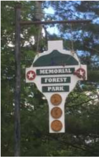
Figure 8. Park sign fabricated in 2018 by Mount Abe Design Technologies Education Department.

Other volunteer organizations that may contribute to future maintenance and improvements at the park include the Boy Scouts and Girl Scouts, as well as students from Mount Abraham Union High School. The current sign at the park (Figure 8) was designed and constructed by students from the Mount Abe Design Technologies Education Department in 2018. The New Haven River Anglers Association, is a regional group dedicated to the protection and enhancement of the New Haven River, including the Baldwin Creek tributary that flows through the park.