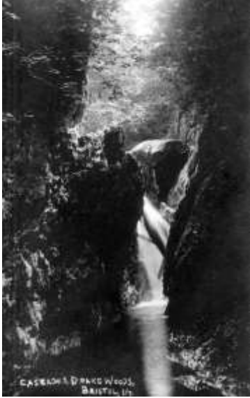
Figure 5. Historic photograph of the falls archived at the Landscape Change Program web site. This c.1911 postcard refers to the waterfall as the Cascades at Drake Woods, Bristol, VT.