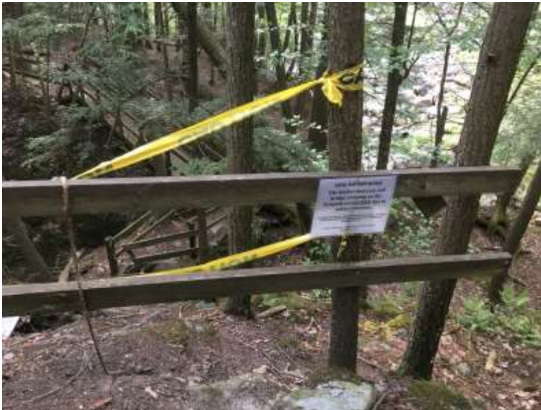
Figure 7. Signage, caution tape, and wooden planking mark the end of the footpath and closure of the bridge crossing at Memorial Park.

Nature trails and a timber bridge on steel I-beams were developed at the park in the 1960s, so that users would have access to view the falls, and explore the ecology and geology of the park. Conditions of the trail, timber steps, railings and bridge have since deteriorated over the decades. Originally, the trail system to access this bridge included a steep wooden staircase to traverse a steep bedrock slope (Figure 4). Due to deteriorating conditions of this staircase and related safety concerns, it was dismantled by the Conservation Commission in the fall of 2019, and the bridge trail was closed until further notice. Wooden planking and caution tape along with signage are used to block the trail at the former location of the head of staircase (Figure 7). Caution tape was also used to block access to the east end of the bridge. During weekly inspections of this area, the Recreation Department has reported occasional breaching of the caution tape, and has reinstalled the tape.