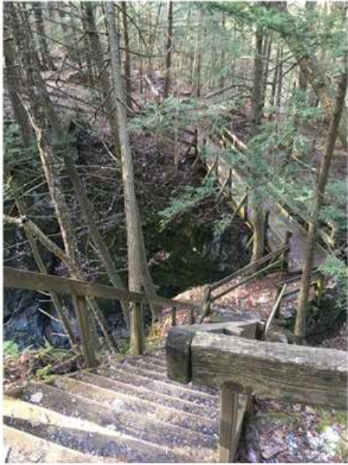
Figure 4. Original wooden staircase leading to footbridge over chasm for viewing Burnham Falls. Due to deteriorating conditions and safety concerns, this staircase was dismantled in the fall of 2019, and the bridge trail was closed until further notice.