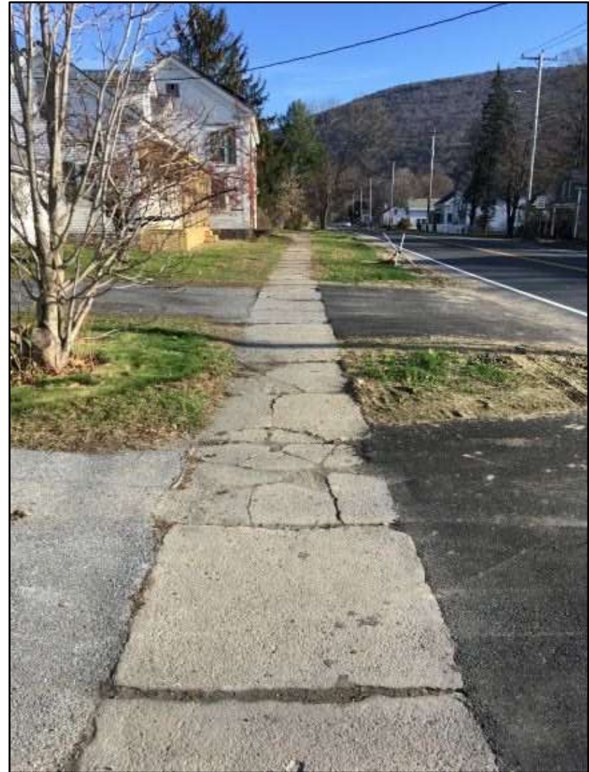
Figure 2. East Street looking eastward. (11/20/2020)