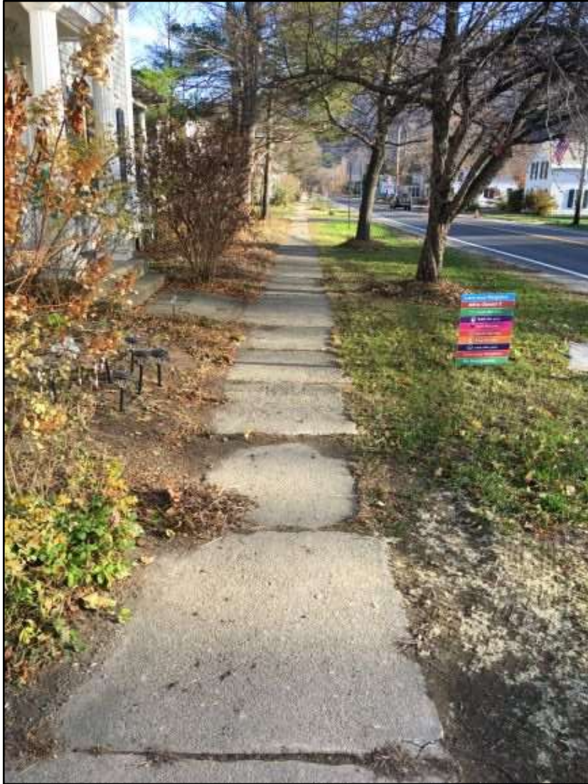
Figure 7. East Street looking eastward. (11/20/2020)