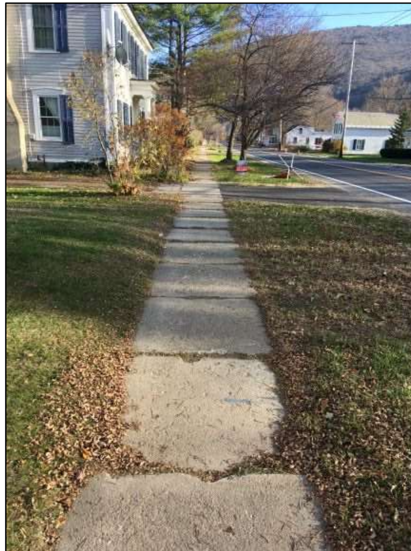
Figure 6. East Street looking eastward. (11/20/2020)