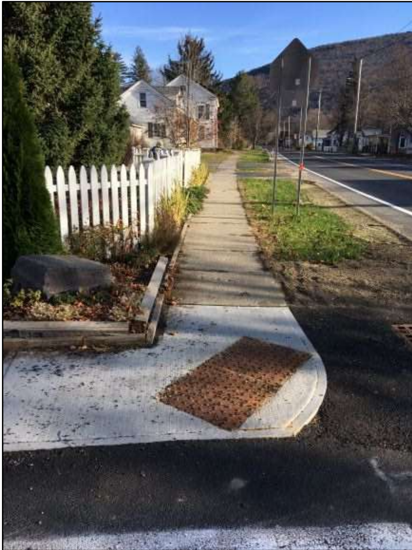
Figure 1. East Street at Mountain Street looking eastward. (11/20/2020)