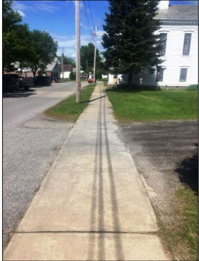
Figure 16. Park Place looking westward. (06/04/2019)