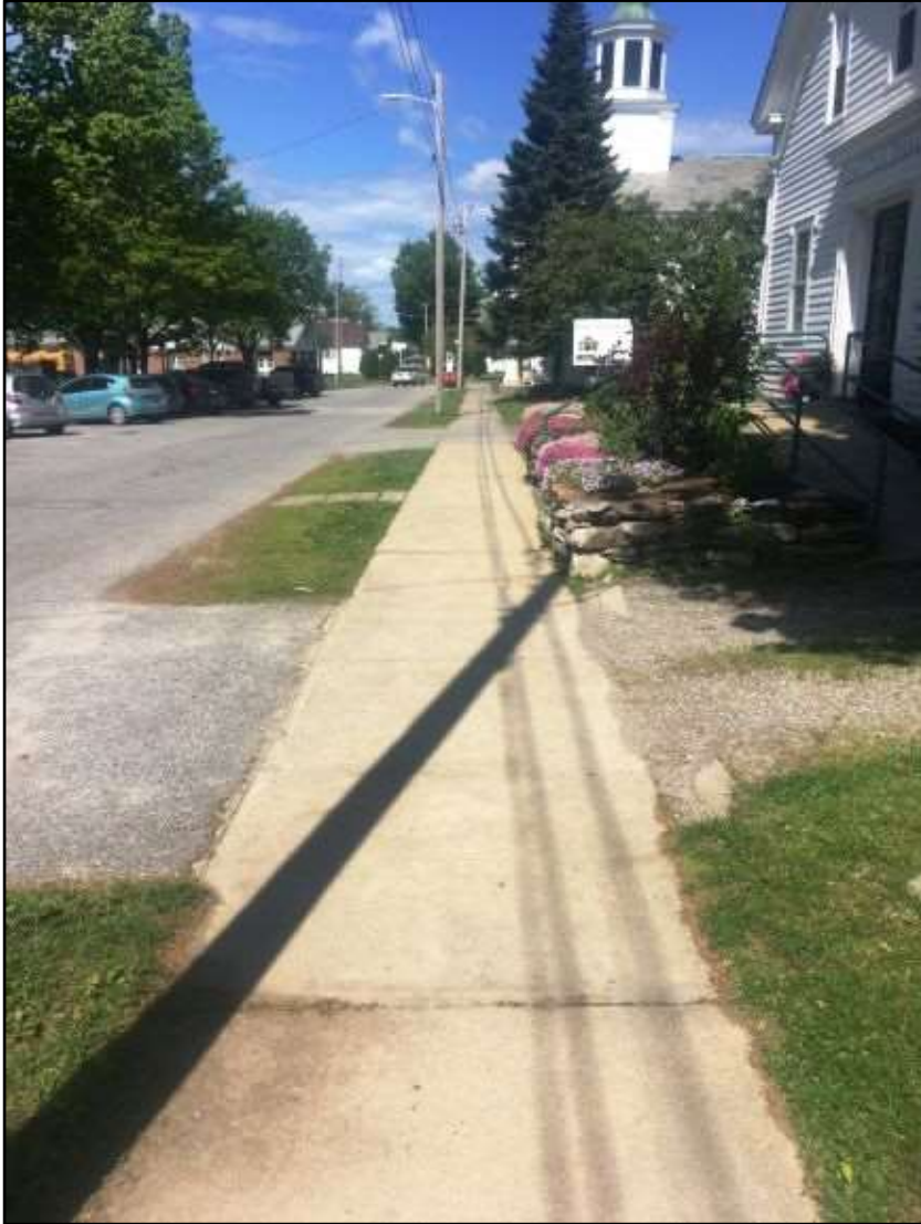
Figure 15. Park Place looking westward. (06/04/2019)