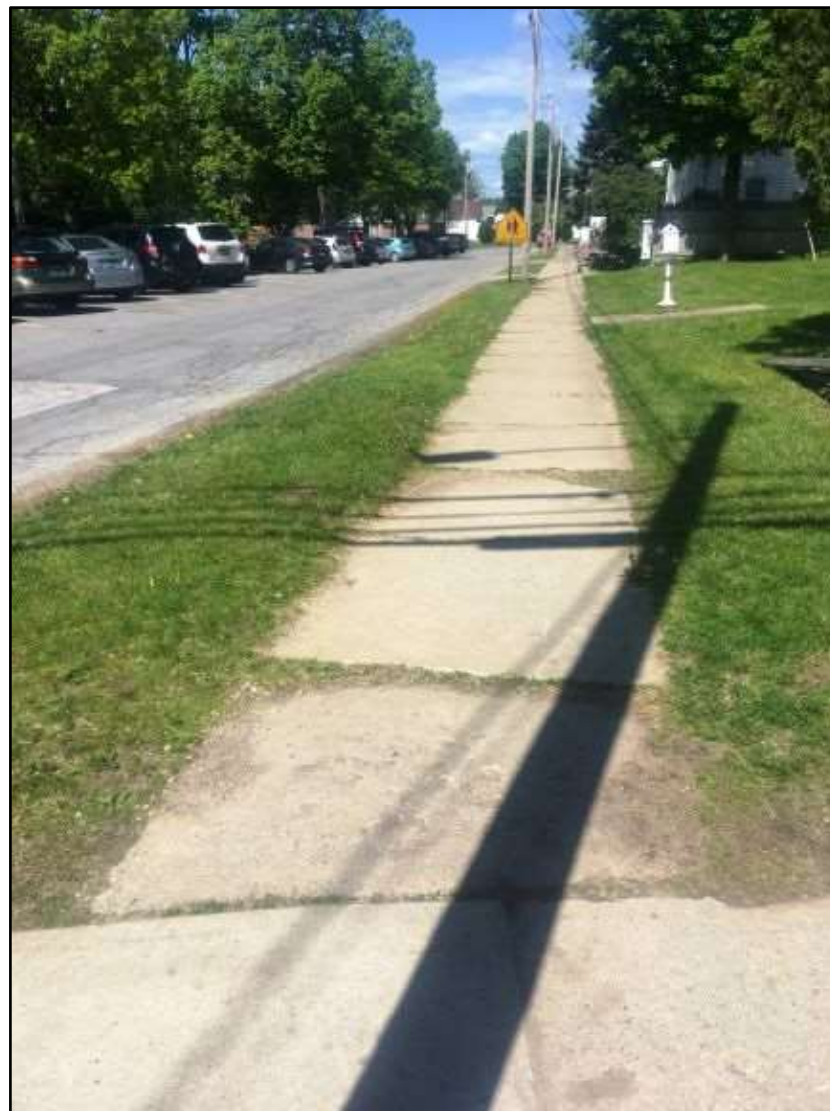
Figure 14. Park Place at North Street looking westward. (06/04/2019)