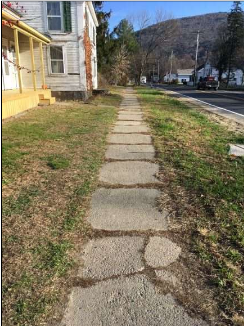
Figure 3. East Street looking eastward. (11/20/2020)