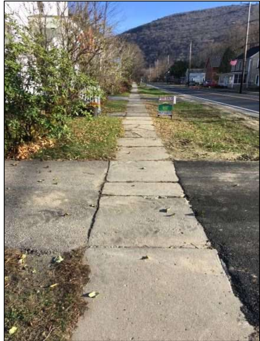
Figure 10. East Street looking eastward. (11/20/2020)