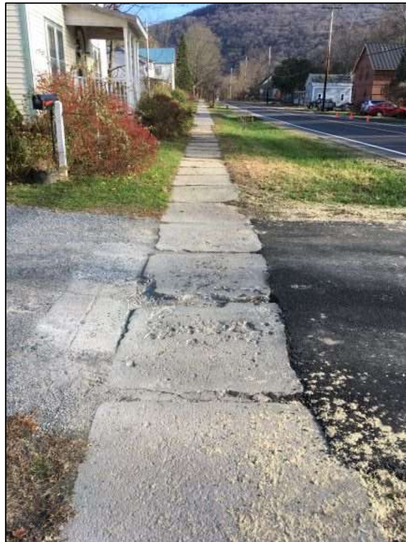
Figure 12. East Street looking eastward. (11/20/2020)