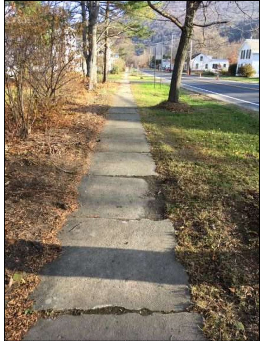
Figure 8. East Street looking eastward. (11/20/2020)