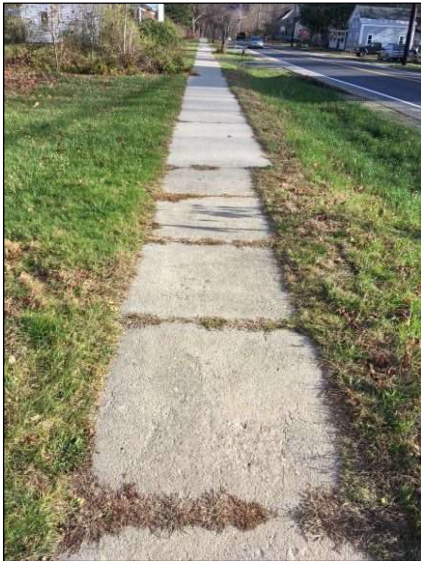
Figure 13. East Street looking eastward. (11/20/2020)