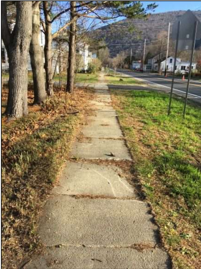
Figure 9. East Street looking eastward. (11/20/2020)