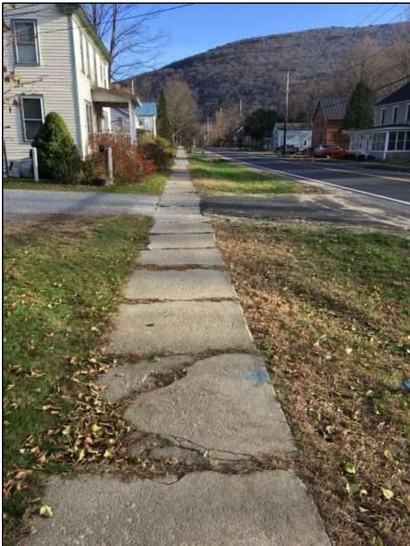
Figure 11. East Street looking eastward. (11/20/2020)