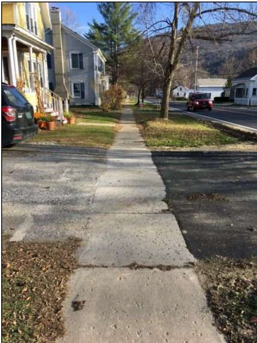
Figure 5. East Street looking eastward. (11/20/2020)