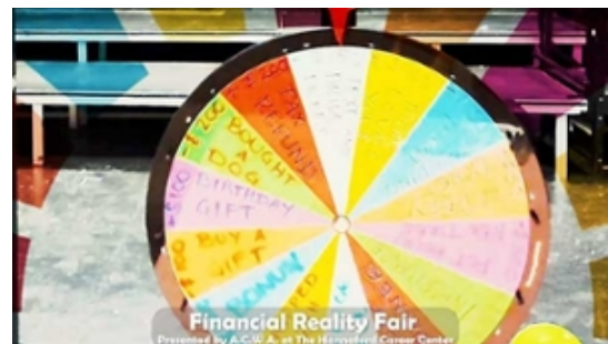
Financial Reality Fair Photo Gallery