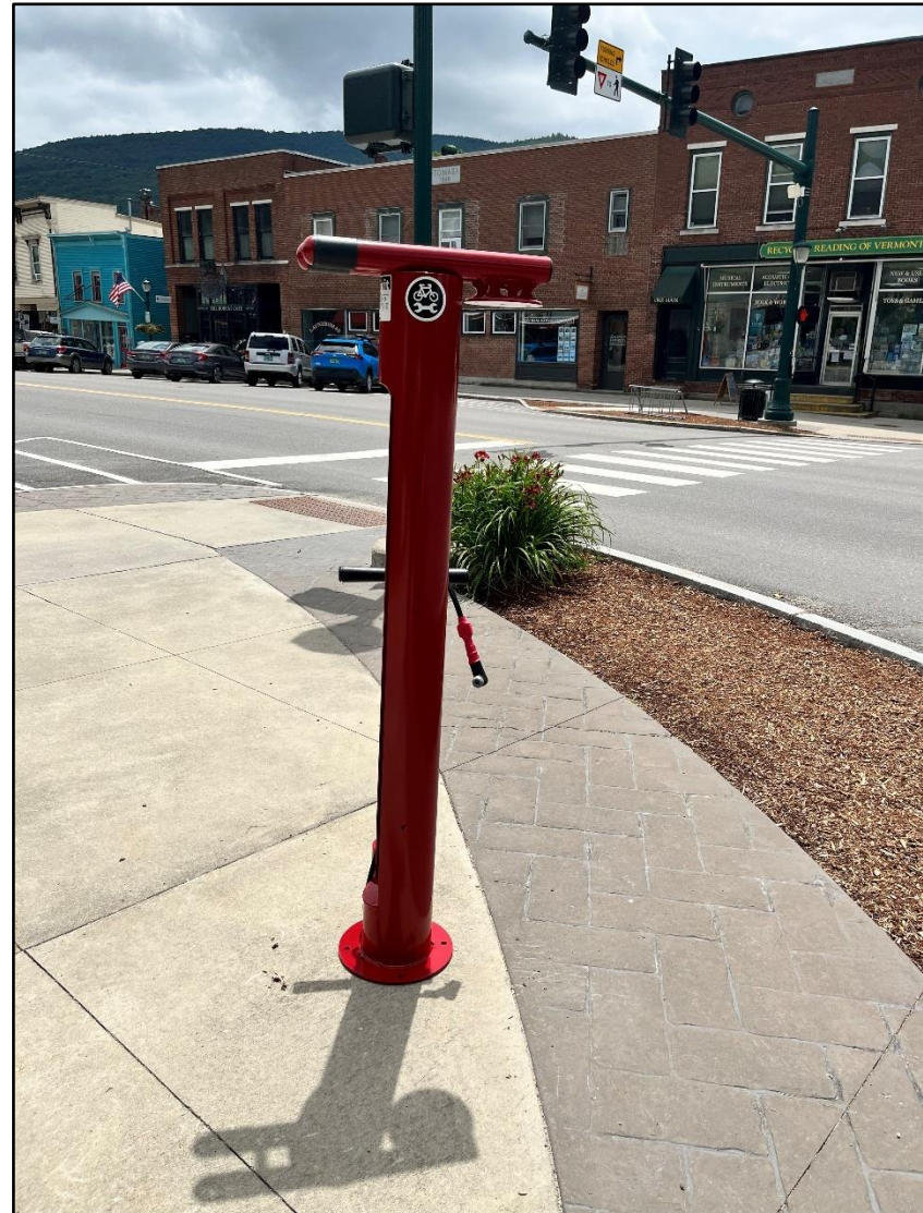
Figure 2. Corner of Main and North Street, looking Recycled Reading. (07/14/2022)