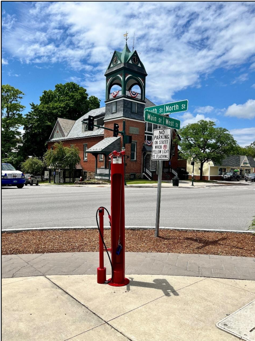
Figure 1. Corner of Main and North Street, looking toward Holley Hall. (07/14/2022)