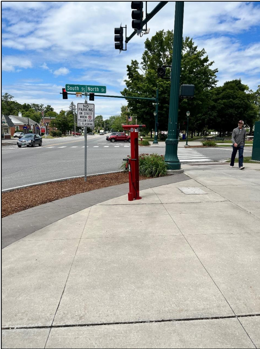
Figure 3. Corner of Main and North Street, looking toward the Town Green. (07/14/2022)