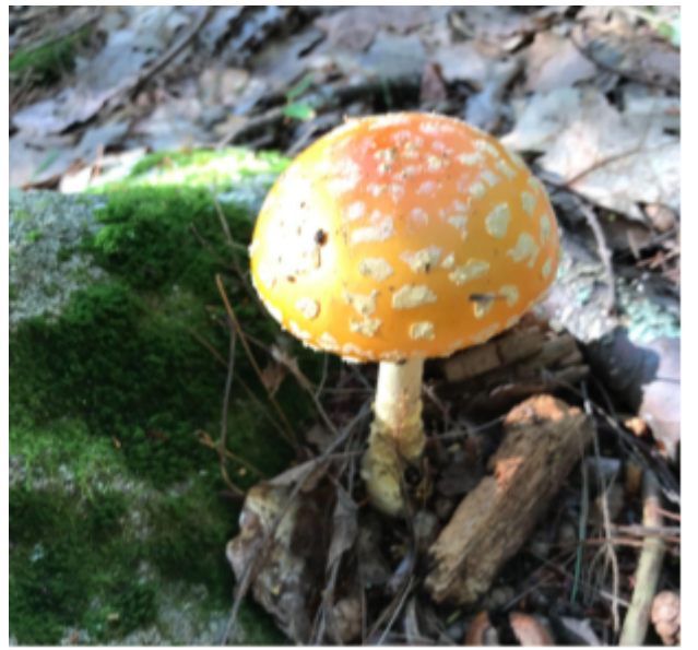
Can you name this mushroom?