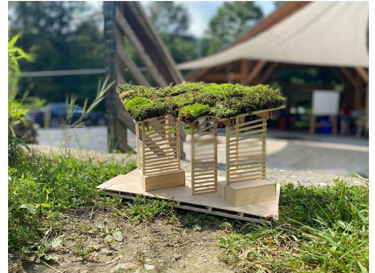
Scale model (demonstrates what the roof would look like if planted)