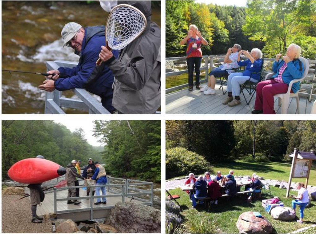
Figure 5. Eagle Park sees regular use by anglers, kayakers, picnickers and fitness classes.