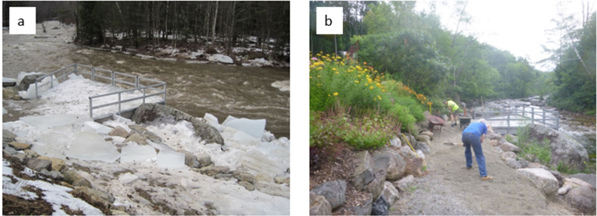
Figure 6. Universal Fishing Platform (a) receives ice during thaw event on January 30, 2013. (b) Bristol CC members replace gravel on access ramp to the platform during an August repair activity following flooding on July 1, 2017 that eroded a segment of the walkway.

Two past flood events were sufficiently impactful to result in more substantial damages. Both floods were federally-declared disaster events. The first occurred in 2011 on August 28 during Tropical Storm Irene – a flood with an annual exceedance probability of approximately 3% in the New Haven River watershed (Olson, 2014). The gravel-packed access ramp was washed out, and expenses to restore the ramp were reimbursed, in part, through federal and state grants. The second substantial flood event occurred on November 1, 2019. Heavy rains following a wet October, generated peak flows on the New Haven River with an annual exceedance probability of 1 to 2% (Olson, 2014). Post-event site inspections and survey indicated that floodwaters rose to approximately 1 foot over the top surface of the platform, and the upstream anchoring boulder moved (SLR Corp presentation to Selectboard, 9/27/21). Brackets attaching the platform were separated from the boulder, and the platform is now off-level. The concrete ramp was undermined and cracked.