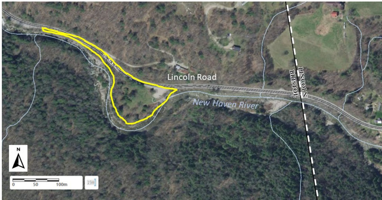
Figure 1. Approximate boundaries of Eagle Park, accessed from a parking area on the south side of Lincoln Road (Property boundaries, approximated from Bristol Tax Parcel Maps, are for planning purposes only and do not represent actual surveyed boundaries).

Eagle Park is a 5.5-acre parcel located at 908 Lincoln Road approximately 0.7 mile east of Bartlett’s Falls near the Bristol-Lincoln town line (Figure 1). The park offers a sparsely-forested meadow along the New Haven River for bird-watching, picnicking, and recreating, and features the Chuck Baser Memorial Universal Fishing Platform that provides Americans with Disabilities Act (ADA) compliant access to the river for fishing. The property is owned by the Town of Bristol, and is jointly managed by the Bristol Selectboard, the Recreation Department and the Conservation Commission.