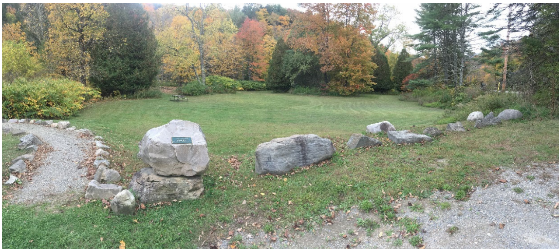
Figure 4. Maintained meadow just south of the Eagle Park gravel parking lot; entry to ADA-compliant gravel-packed access path to Universal Fishing Platform.

Tree species include Eastern Hemlock, White Pine, Ash, Yellow and White Birch, Sugar Maple and Red Maple.