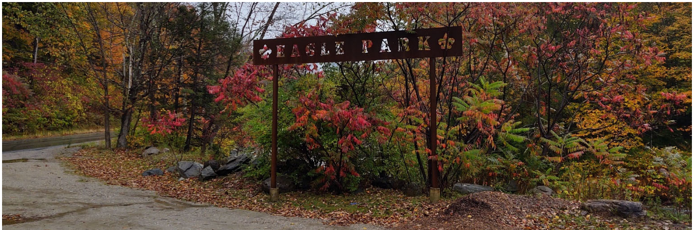
Figure 3. Eagle Park sign

Following acquisition of the parcel in 2000, the town of Bristol maintained Eagle Park as a day-use area with recreational access to the New Haven River. Boulders were installed along the perimeter of the parking area to prevent vehicular access through the park. The grass lawn areas continued to be mowed with access for landscaping equipment permitted through a locked gate along Lincoln Road. A sign for the park was constructed as part of a Boy Scout eagle project (Figure 3).