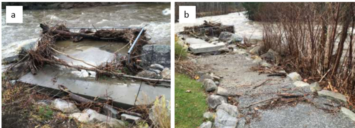
Figure 7. (a) Large woody debris was caught by the UFP railings during flooding on Oct 31 – Nov 1, 2019. (b) Floodwaters eroded gravel from the access path and the concrete slab cracked when undermined during this same event.

Two past flood events were sufficiently impactful to result in more substantial damages. Both floods were federally-declared disaster events. The first occurred in 2011 on August 28 during Tropical Storm Irene – a flood with an annual exceedance probability of approximately 3% in the New Haven River watershed (Olson, 2014). The gravel-packed access ramp was washed out, and expenses to restore the ramp were reimbursed, in part, through federal and state grants. The second substantial flood event occurred on November 1, 2019. Heavy rains following a wet October, generated peak flows on the New Haven River with an annual exceedance probability of 1 to 2% (Olson, 2014). Post-event site inspections and survey indicated that floodwaters rose to approximately 1 foot over the top surface of the platform, and the upstream anchoring boulder moved (SLR Corp presentation to Selectboard, 9/27/21). Brackets attaching the platform were separated from the boulder, and the platform is now off-level. The concrete ramp was undermined and cracked.