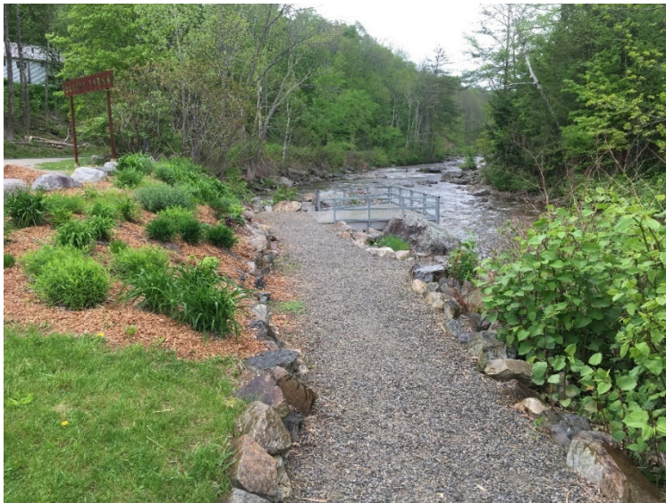
Figure 9. Access ramp leading to the UFP is flanked by a perennial garden on the north and invasive Japanese Knotweed to the south. (Photo dated prior to 2018).

Eagle Park is a day-use site open from dawn to dusk. No public access is allowed between dusk and dawn, except for specific activities granted prior approval by the Selectboard. Motorized vehicles are not permitted at the park. Visitors may enjoy swimming or wading in the river, however no life guard is available. Trespassers between dusk and dawn will be handled according to the Town’s Trespass Ordinance.