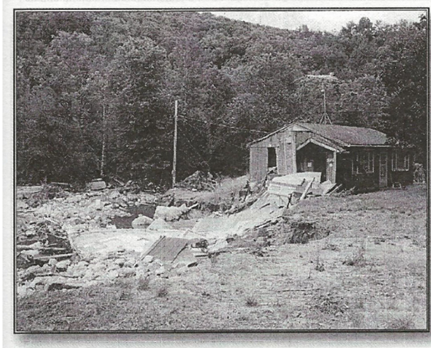
Figure 2. Buildings previously on site were damaged during the 1998 flood.

The town of Bristol acquired the lands of Eagle Park in 2000 during recovery efforts following the flood of July 1998 (Figure 2). Grant funding from the VT Agency of Commerce & Community Development supported site cleanup and buyout of these lands which were subsequently conveyed to the town. A condition of the buyout was that the site remain undeveloped and be incorporated into the Town's park system (Bristol Land Records).